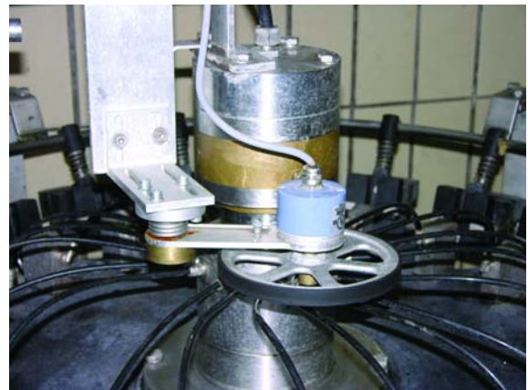
Fig 2: Virtually non-slip application of the measuring device via spring lever and measuring wheel