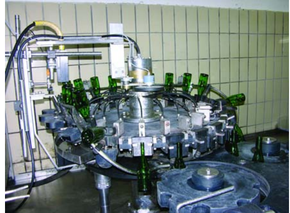
Fig 1: Precise measurement of bottle position for the start of printing

The high IP67 protection rating, permissible shaft loads of up to 400 N and a wide temperature range make the Wachendorff WDG incremental encoders the right choice, even under harsh operating conditions. Their EMC design ensures secure signals. A special output gives early warning that the LED performance is degrading - this occurs around 1000 hours before the encoder could actually fail, so that appropriate timely action can be taken to keep the system safe.