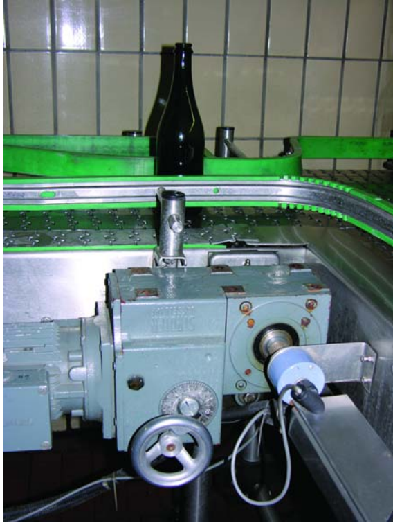
Fig 3: Measurement of the bottle position for optimal quality inspection