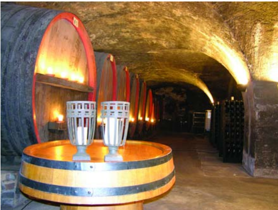
Fig 4: Synergy - traditional production and hi-tech processing

Any Questions? Just call Dieter Schömel +49 (0) 67 22/9965-10, send him an E-Mail at sco@wachendorff.de or call your local distributor.